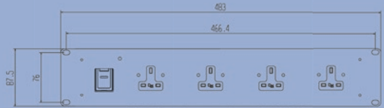
D13-04H 2U 4 WAY HORIZONTAL