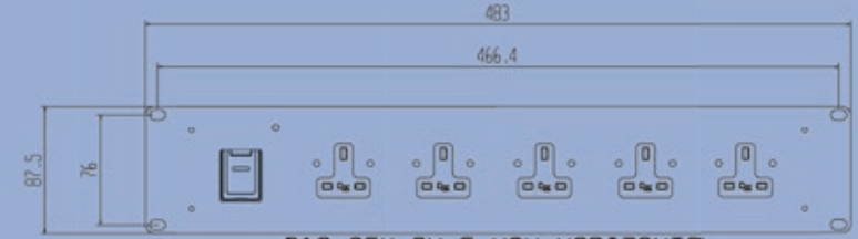
D13-05H 2U 5 WAY HORIZONTAL