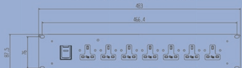
D13-07H 2U 7 WAY HORIZONTAL