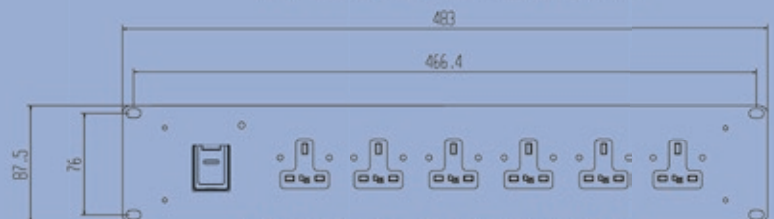
D13-06H 2U 6 WAY HORIZONTAL